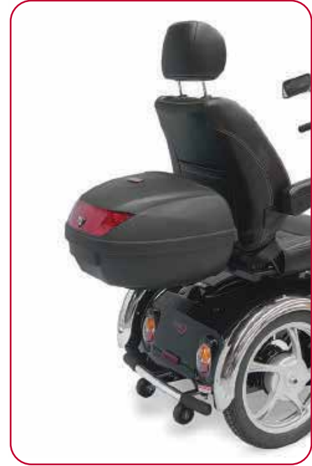
Rear storage pod