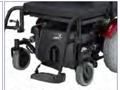
Optional swing away footrests