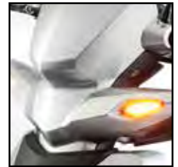
Modern LED lighting system