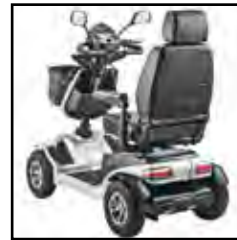
Modern LED lighting system