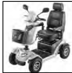
Modern LED lighting system