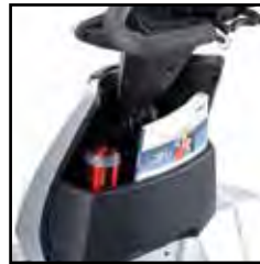
More space for storage