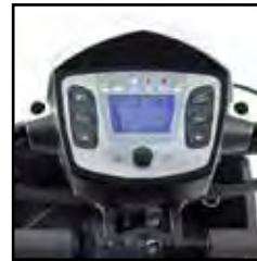
Digital LCD dashboard display