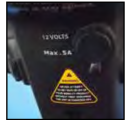
Handy 12 volt socket

Overall Dimension : A x B x C 130 x 69 x 125cm/51 x 27 x 49"