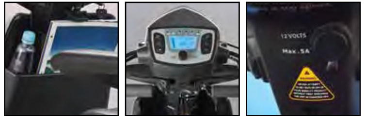
More space for storage