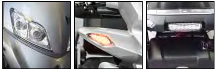
Modern LED lighting system delivers brilliant light with less power consumption